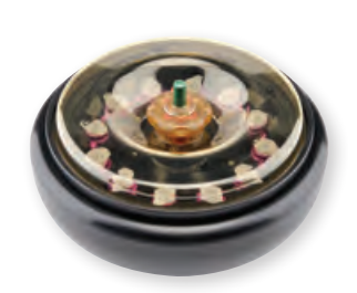
MT-12 Swinging Bucket Rotor