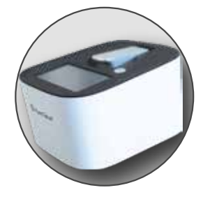
STAND-ALONE DEVICE The microvolume drop reader and cuvette reader are both integrated under one lid making the FastGene® NanoView ultrasmall, silent and an absolute lightweight.